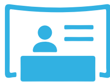
FREE BOOTH AT THE SELANGOR SMART CITY AND DIGITAL ECONOMY CONVENTION 2018