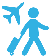
FULLY FUNDED 1 WEEK OVERSEAS FIELD STUDY TRIP