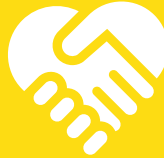
PILOTING OPPORTUNITIES WITH INDUSTRY PARTNERS